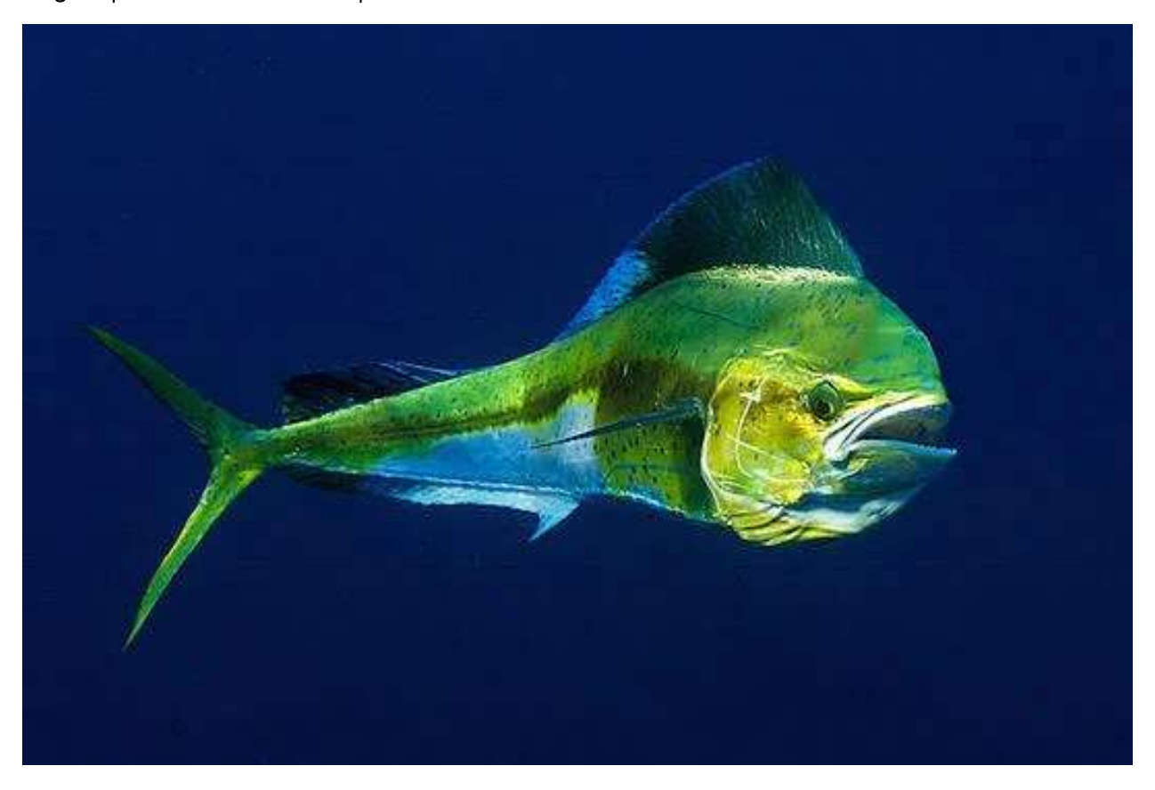
Target Species - Dorado or Dolphin Fish

Commonly called Dolphin Fish or Dorado, these beautifully marked pelagic and migratory fish inhabit all of the world's tropical seas. It is a prized light tackle sport fishing target and well respected for its acrobatic and aerial display. Vivid gold and blue when lit up during the fight it will readily take lures and flies cast around floating structures as well as baits cast in their vicinity when feeding.