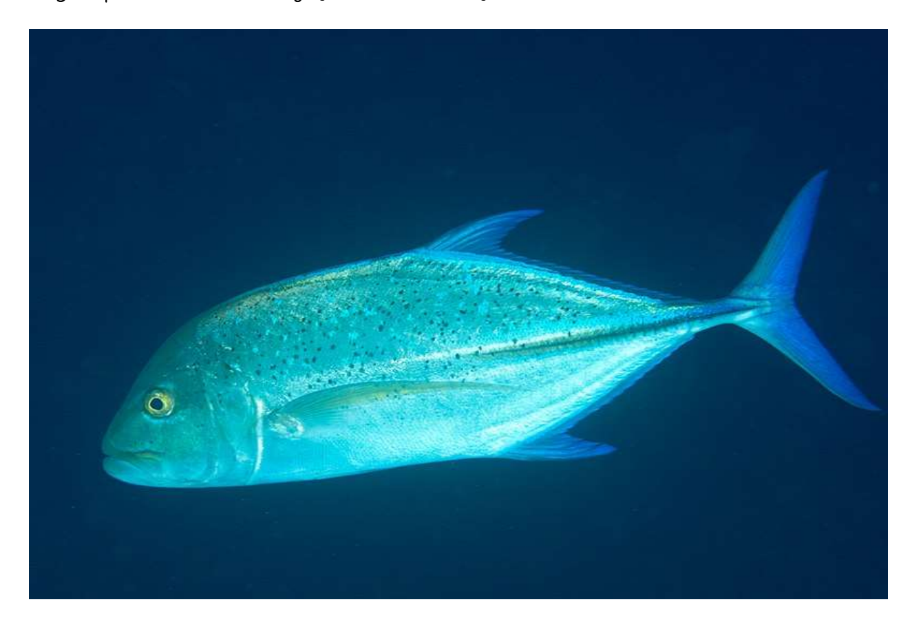
Target Species - Giant Trevally/ Jack Fish/ Bluefin Jack

More commonly called just GT's by most anglers, Giant Trevally are marauding brutes right up there with the best. Commonly caught by both lure and bait fisherman, specimens range from the smaller 2-3lbs school Trevally commonly caught in the estuary environment, right up to the 50lbs thugs.